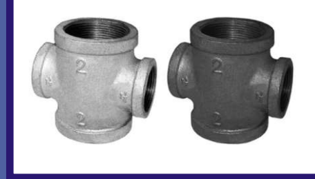
ARCR, BR CR REDUCING CROSSES