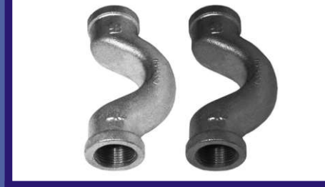
NOS CROSS OVER