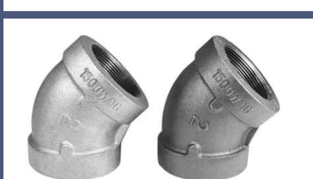
AXHL 45° ELBOWS 45°