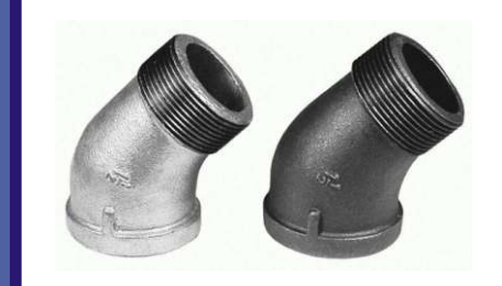
ASL 45° BSL 45° STREET ELBOWS 45°