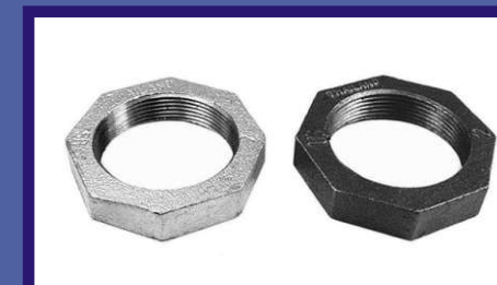
ALN, LN LOCKNUTS