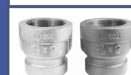
AXHRS REDUCING COUPLINGS