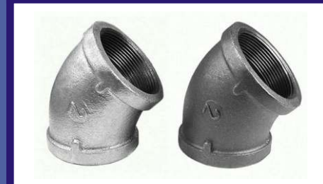
AL 45° BL 45° ELBOWS 45°