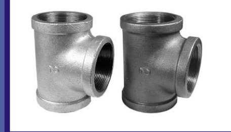
AT, BT TEES