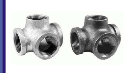
ASOT, BSOT SIDE OUTLET TEES