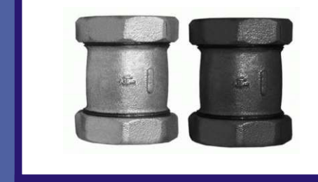
ASLCC SHORT COMPRESSION COUPLINGS