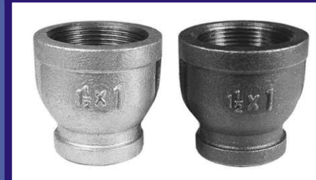
ARS, BRS REDUCING COUPLINGS