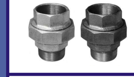
U341 UNIONS CONICAL IRON TO IRON SEAT, M&F