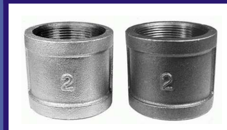
AS, BS COUPLINGS (SOCKETS)