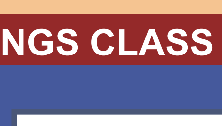
ACU, BCU UNIONS CONICAL BRASS SEAT