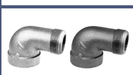
AXHSL 90° STREET ELBOWS 90°