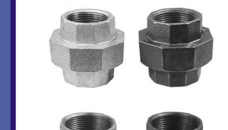
U UNIONS FLAT SEAT WITHOUT GASKET