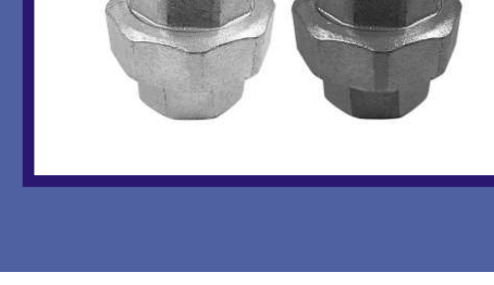
ARCU REDUCING UNIONS