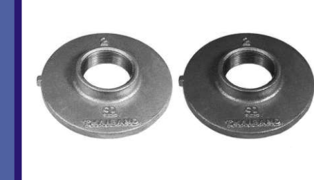
F ROUND FLANGES