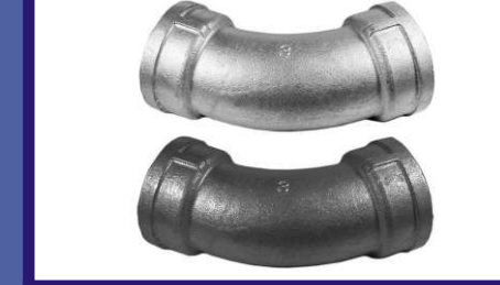
BF 45° BENDS FEMALE 45°