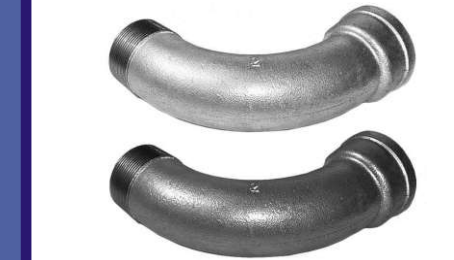
BMF 90° BENDS M & F 90°