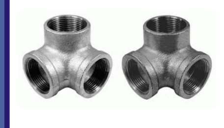
ASOL, BSOL SIDE OUTLET ELBOWS