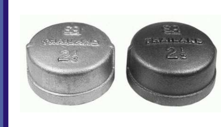
ACA, BCA CAPS