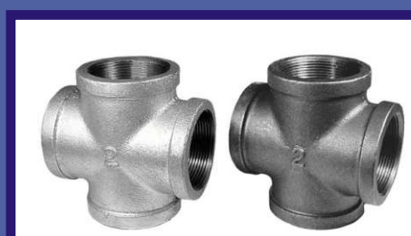
ACR, BCR CROSSES