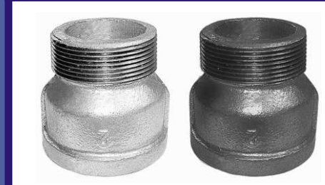
AX, BX EXTENSION PIECES