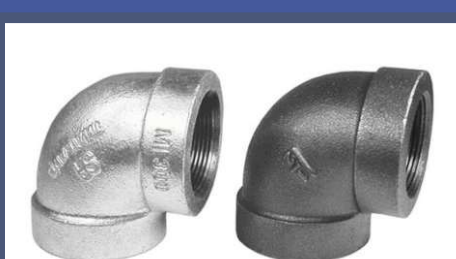
AXHL 90° ELBOWS 90°