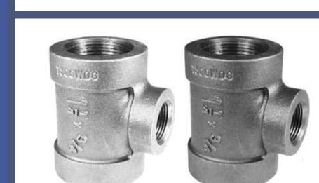
AXHRT REDUCING TEES