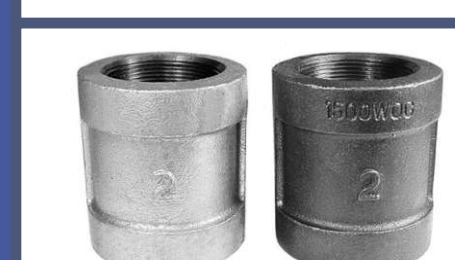
AXHS COUPLINGS (SOCKETS)