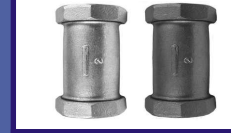
ALCC LONG COMPRESSION COUPLINGS