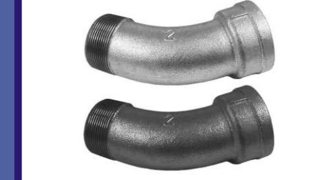
BMF 45° BENDS M & F 45°