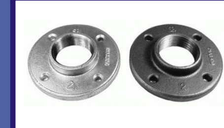
AFF FLOOR FLANGES FD FLANGES 'D'