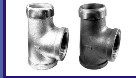
AST, BST SERVICE TEES