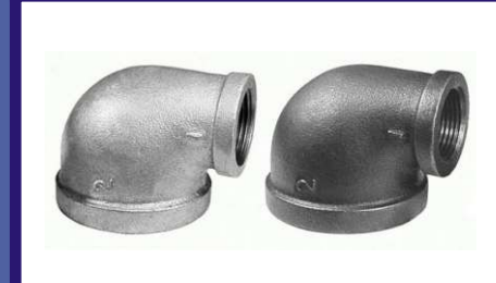
ARL, BRL REDUCING ELBOWS