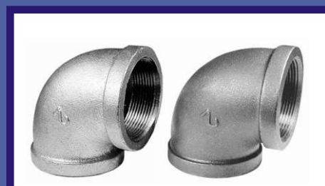
AL 90° BL 90° ELBOWS 90°