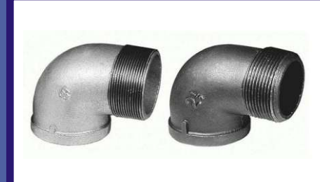
ASL 90° BSL 90° STREET ELBOWS 90°