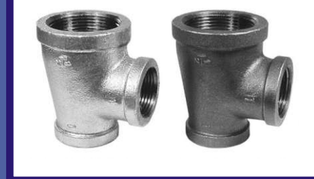
ART, BRT REDUCING TEES