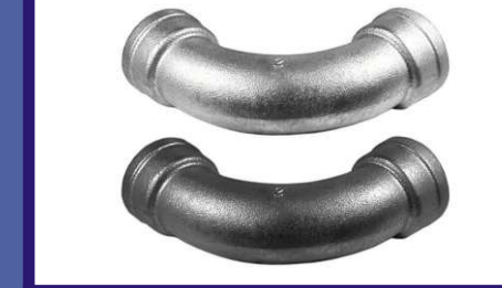
BF 90° BENDS FEMALE 90°