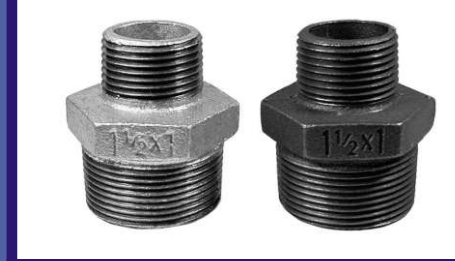
RNI REDUCING NIPPLES