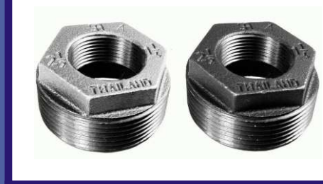
ABU, BU BUSHINGS